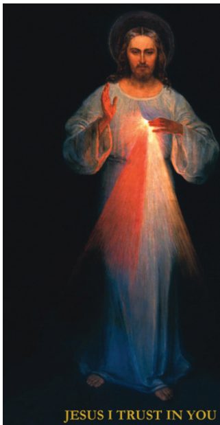
JESUS I TRUST IN YOU